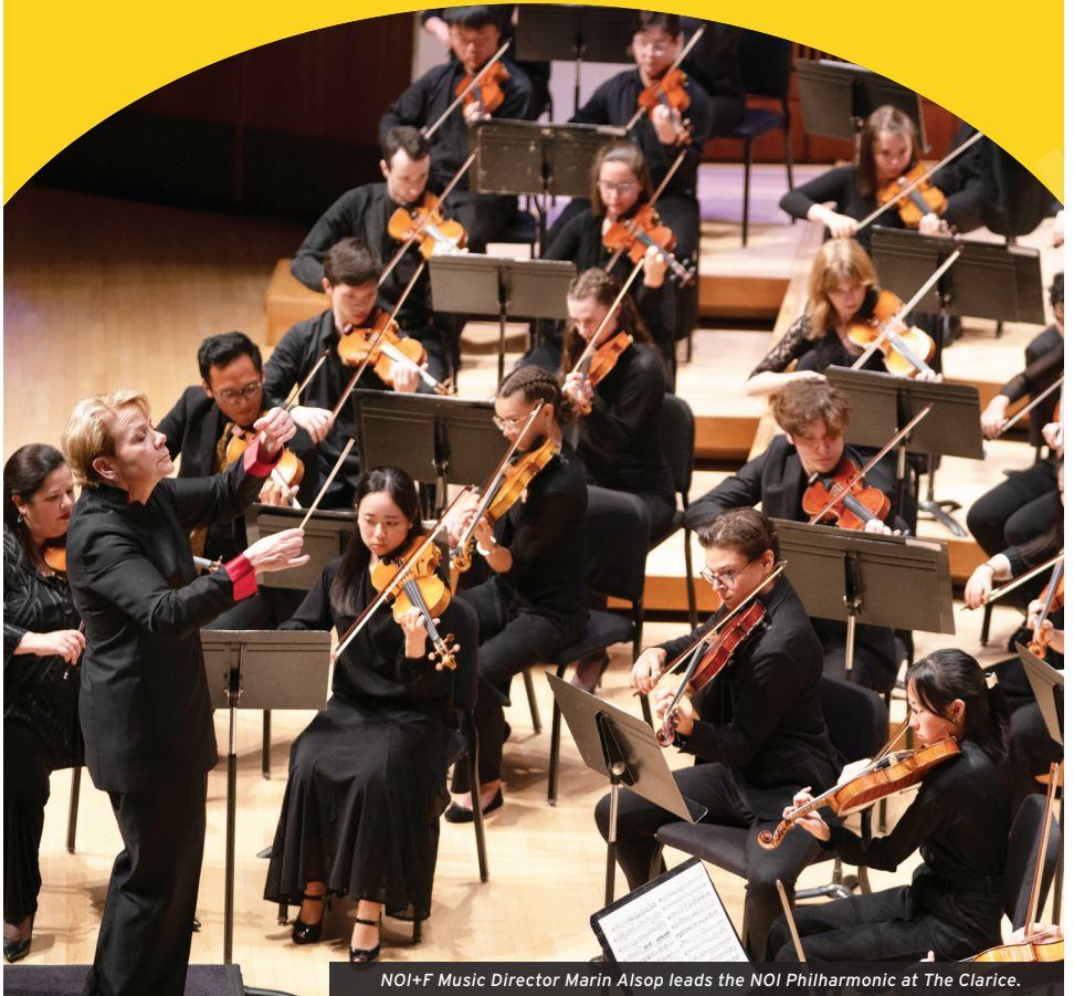
NOI+F Music Director Marin Alsop leads the NOI Philharmonic at The Clarice.

SPARK! Lounge conversations take place at 6:30PM before most NOI Philharmonic performances. Join us for in-depth and lively discussions!